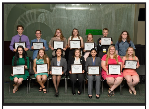
2019 State Award winners with their plaques

Michigan 4-H true leaders ages 11 and older have an opportunity to be recognized for the great work they do in 4-H by completing a state award application. A Michigan 4-H State Award is the highest honor bestowed on a Michigan 4-H member and provides an opportunity to receive recognition for their engagement in rich learning experiences that result in outstanding knowledge and life-skill development.